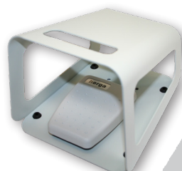
With 6202 Guard